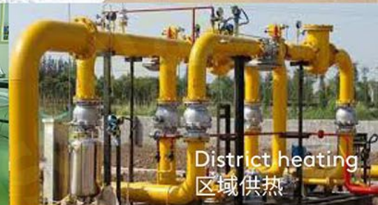
District heating 区域供热