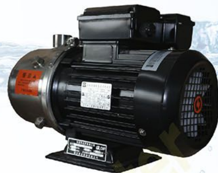
Model | 型号: CNP 4-40