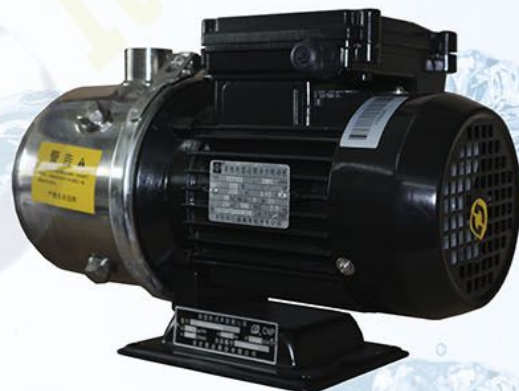
Model | 型号: CNP 2-30