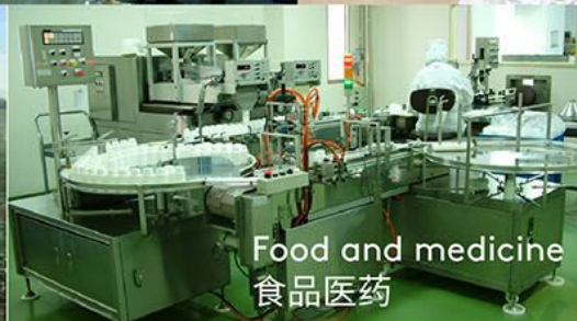
Food and medicine 食品医药