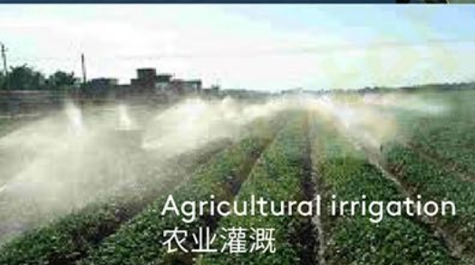
Agricultural irrigation 农业灌溉